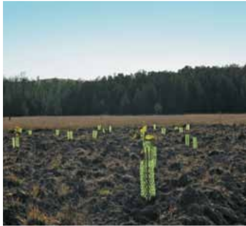
Pictured above: The habitat management zone at Glendell.