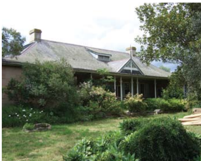
Front of Homestead