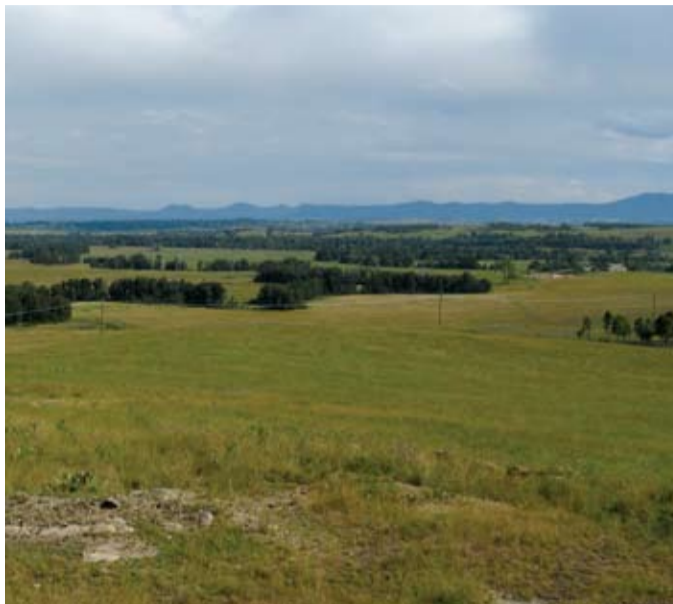
Before infrastructure development