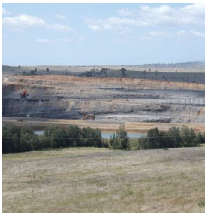
Mining progress at Glendell