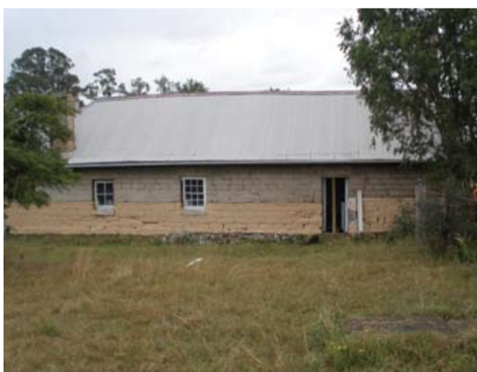
Cocooning of stonework